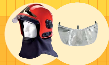
Neck curtain (integral or rear protection) Nomex, wool or aluminised