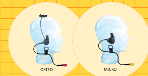
Helmet mounted communication headsets

For more information, please ask for our complete catalogue