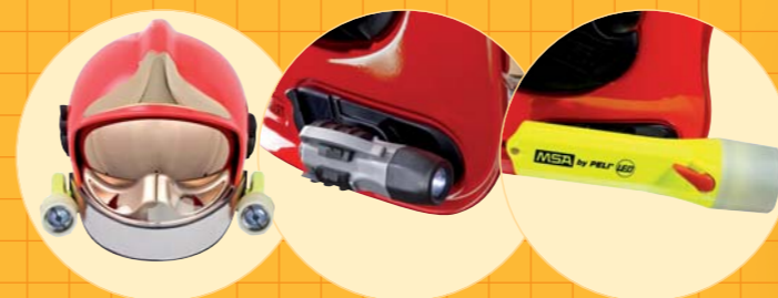
Atex lamps (zone 1 and zone 0) XS and XP range