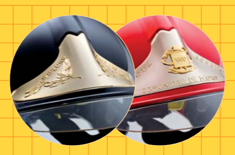
Customised front plate