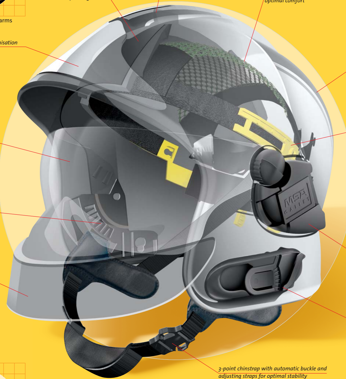
3-point chinstrap with automatic buckle and adjusting straps for optimal stability