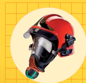
Connection kit for full face masks

Cradle with leather headband and quick size adjustment